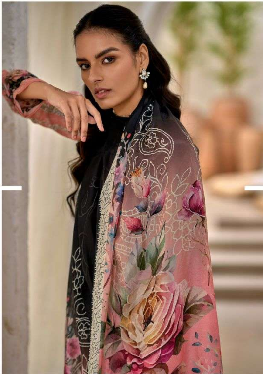
OUTFITS THAT WILL MAKE YOU COMFORTABLY BEAUTIFUL