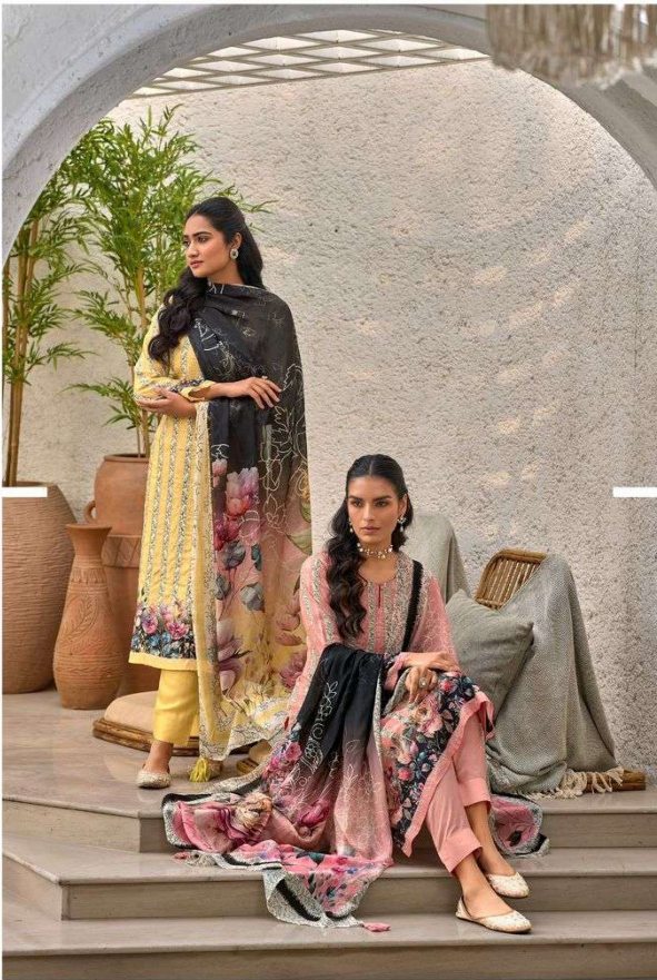
OUTFITS THAT WILL MAKE YOU COMFORTABLY BEAUTIFUL