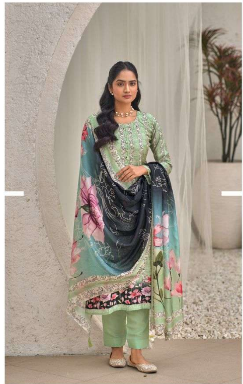
10496 KEEP CALM & SURROUND YOURSELF WITH FASHION