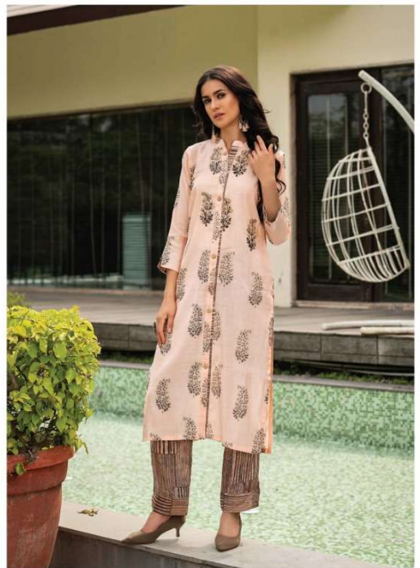
TOP: Foil Print