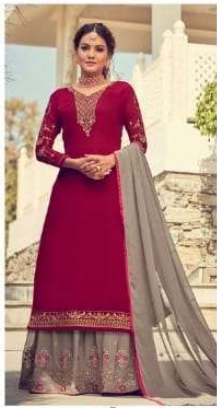
CODE \ 7304