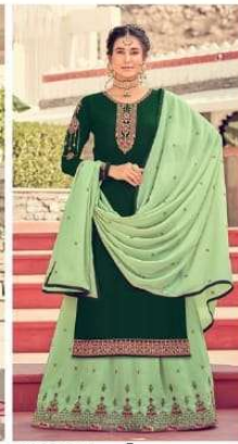
CODE \ 7303