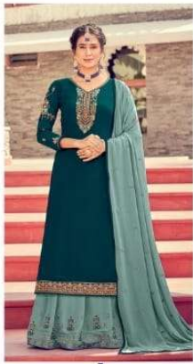
CODE \ 7301