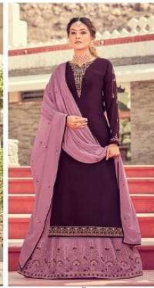
CODE \ 7306