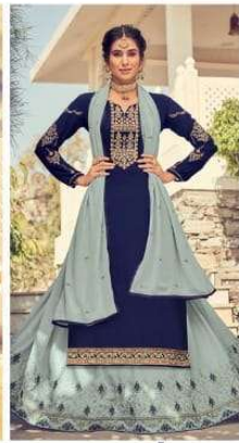
CODE \ 7305