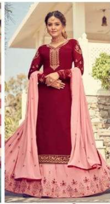
CODE \ 7302