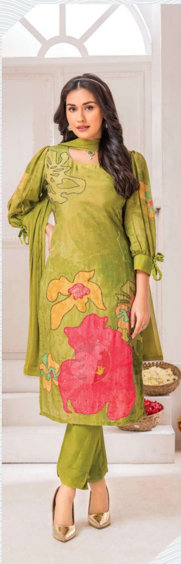
Nappy Shades 3401