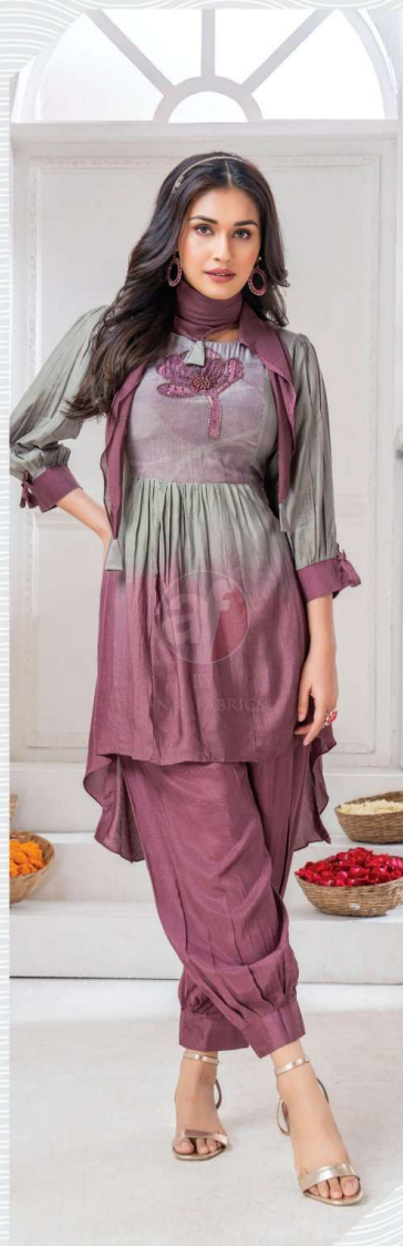
Nappy Shades 3403