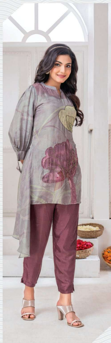
Nappy Shades 3406