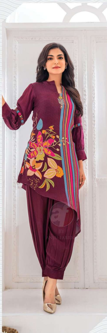
Nappy Shades 3405