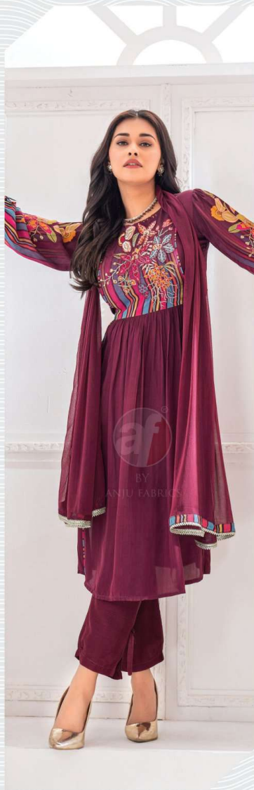
Nappy Shades 3402