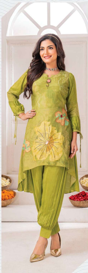
Nappy Shades 3404