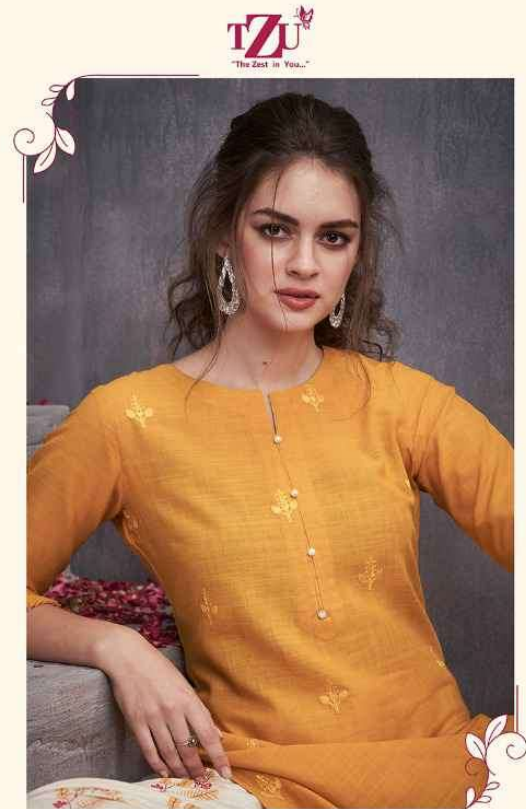
KURTI: COTTON SLIR WITH COMPUTER EMBROIDERY PALAZZO FABRIC: COTTON FLEX WITH ETHNIC BLOCK STYLE PRINT. -1001-