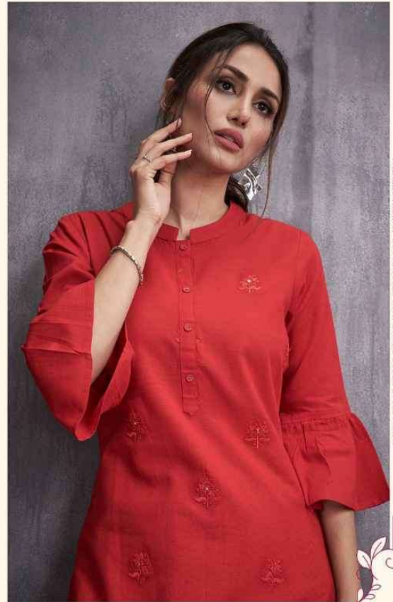
KURTA: COTTON SLUR WITH COMPUTER EMBROIDERY PALAZZO: FASHION COTTON TILK WITH ETHNIC BLOCK STYLE PRINT