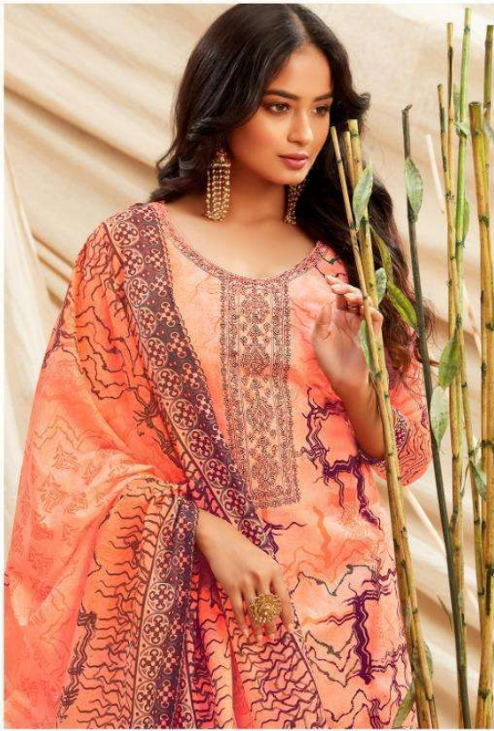
S - 544 - 009 | what is the key factors between design and trends? it's a fashion connection of both are essential to give perfect fashion look to you.