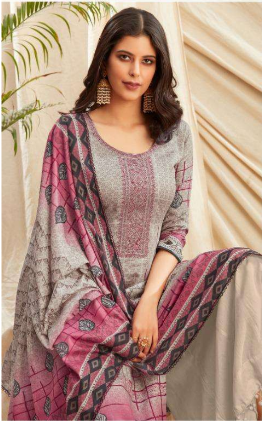
the mytic beauty of cool season shades from last past years, and company growing with almost in past years. S - 544 - 006